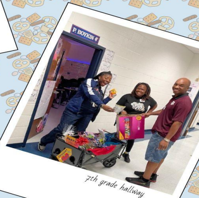
7th grade hallway

AFTERNOON TREATS DELIVERED TO OUR DOORS? YES, PLEASE! THANK YOU PTO!