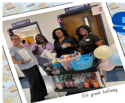
6th grade hallway